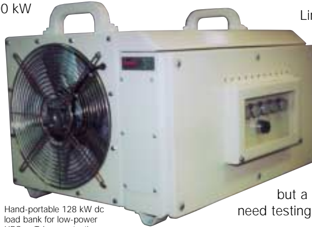
Hand-portable 128 kW dc load bank for low-power UPS or Telecoms testing.

Links up to 10 load banks of any size together to form a much larger total load. Individual load banks can still be used discretely, each retaining its 1 kW switching resolution. This is ideal for applications where multiple, small loads are tested but a single large load may need testing periodically.