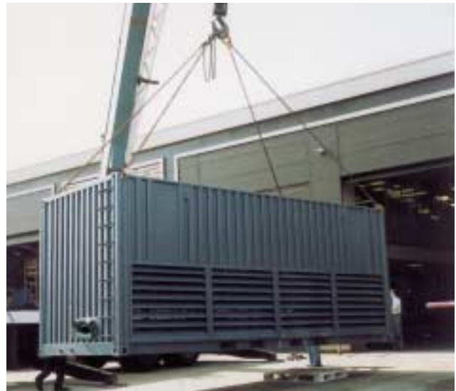
Containerized 3.5 MW load bank.

Water-cooled units can be produced that are ideal for shipboard applications. Units are available without fans for engine radiator mounting.