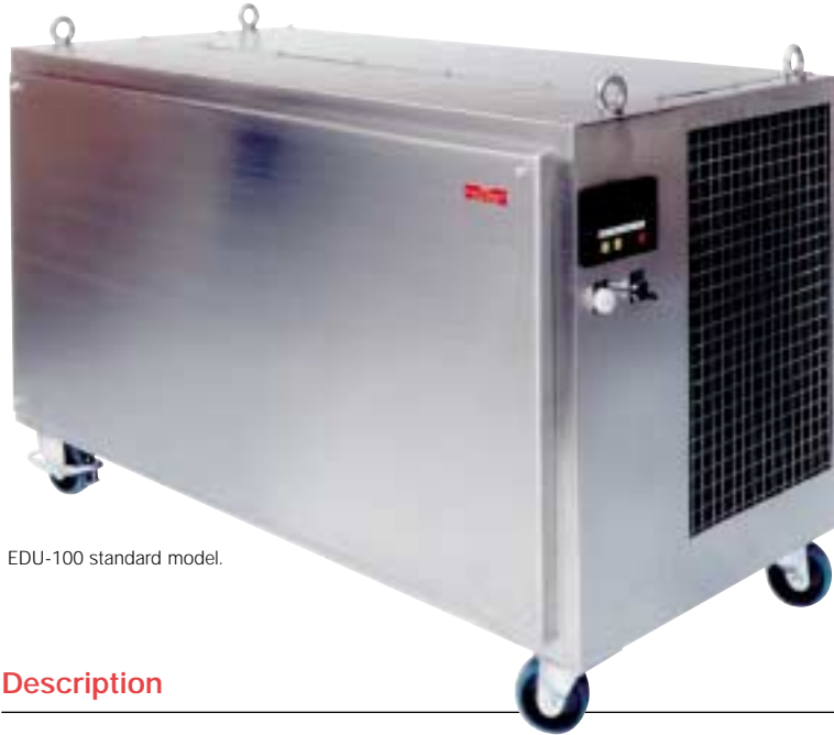
EDU-100 standard model.