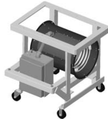
Two DRA-CC Stacked

The DRA-CC series of SuperDragons have the same construction features as the rental grade units except do not include the blower section. The units require customer supplied air via 20" diameter flexible duct. The control circuit includes an air flow switch to protect the heater in case of a restricted or loss of air flow. The control enclosure includes a contactor(s), control transformer, power fusing and power on pilot lights.